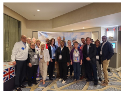
District 6900-PDGs, DG, DGE, DGN & Emerging leaders.