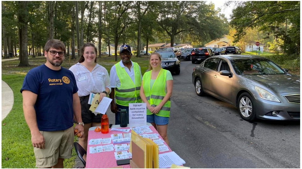
One hundred vehicles were already lined up prior to opening the Fresh Produce Market that morning!