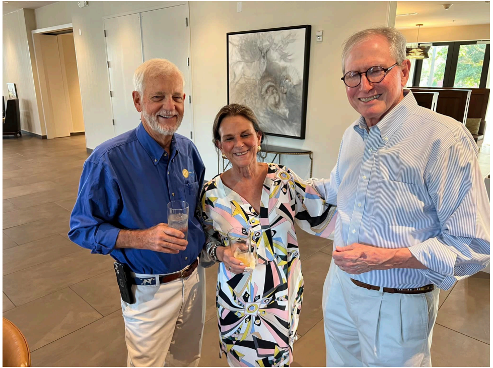
In an effort to grow our membership, every 1st Tuesday of the month we host a social called "Wine or Whine" and August's Wine or Whine social was a HIT!