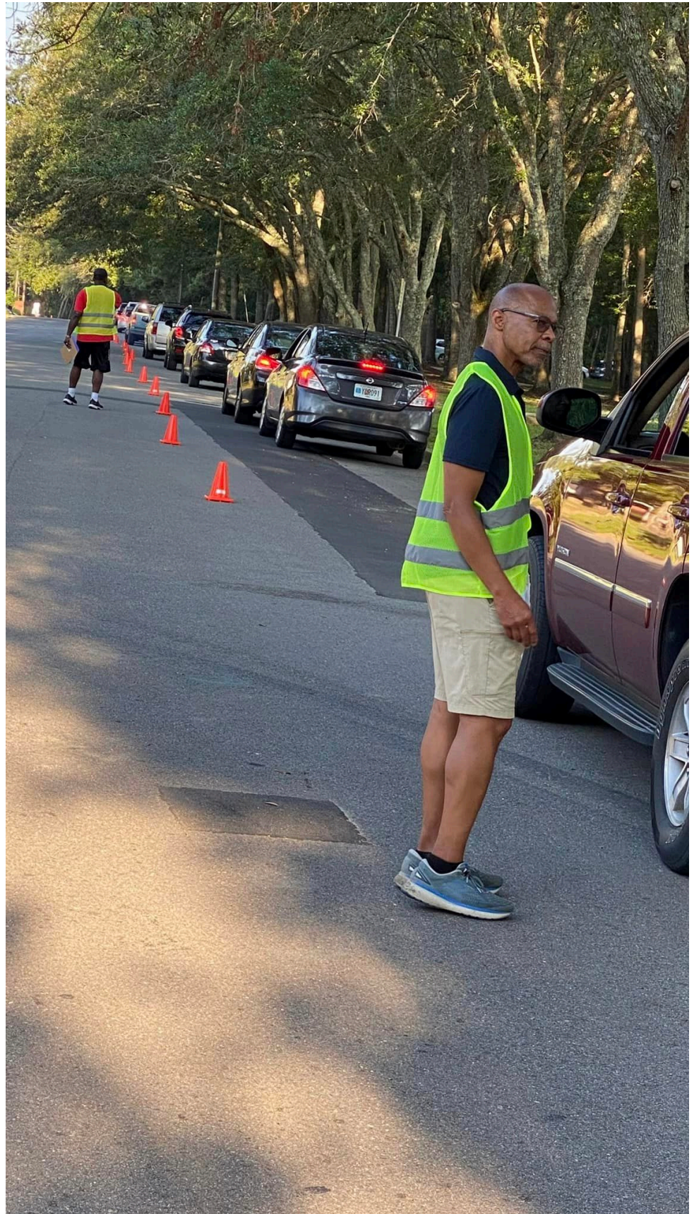
Each household received a variety of fresh and frozen foods, including collards, zucchini, sweet potatoes, blueberries, peaches, oranges, strawberries, and chicken.