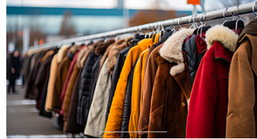
Thursday, Sept. 5