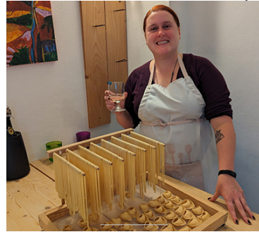
Thursday, Sept. 5