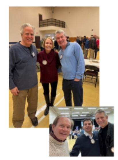
More Meeting Highlights