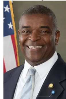
Thursday, Feb. 6