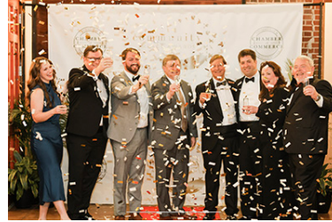
Thursday, March 6