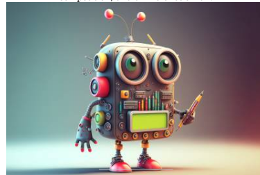
Thursday, March 6

They will bring their award winning bot and their epic STEM skills to Rotary. Watch their robot take on real competitive challenges and maybe get a chance to test your own skills. This presentation will highlight innovation, competition, and a whole lot of fun.