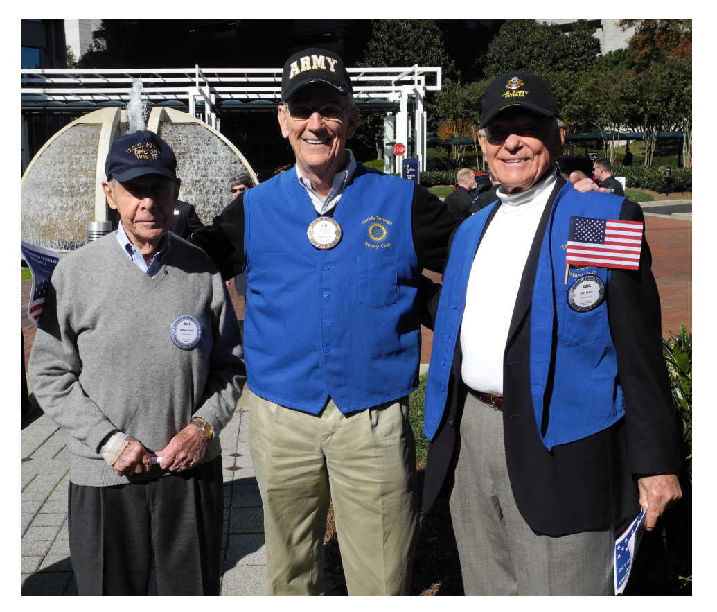
FAMILY OF ROTARY RSVP For 2017 Holiday Party