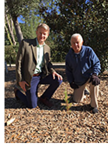
This Week's Program

Tree Planting Challenge-Don't forget to plant your tree. (We would love to get some pictures of you planting your tree.)