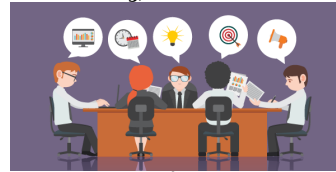
Next Week's Program