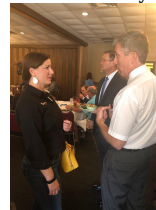
Join Us Friday @ noon to pack supplies in bags

at Thomasville High School & Saturday @ 7 am to 11 am to help give out the bags