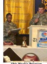
This Week's Program