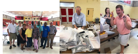
Looks like a good time was had by all