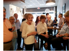
Tomorrow evening, August 9th @ 5:30 pm