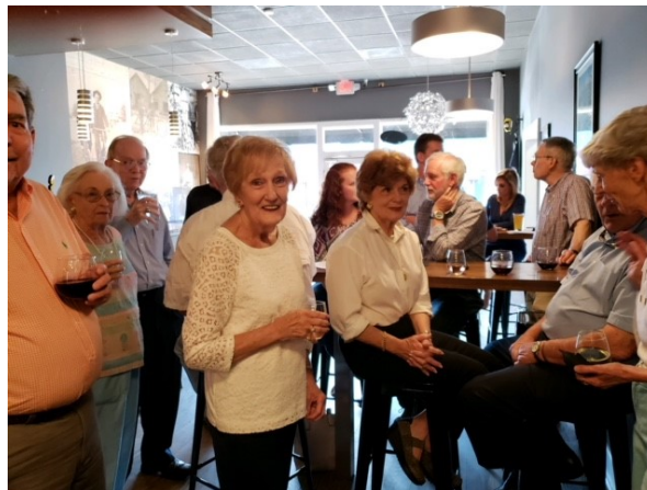
Tomorrow evening, August 9th @ 5:30 pm August Board Meeting, at the Plaza in the Back Room