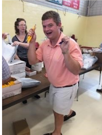
Looks like a good time was had by all Wine or Whine last night