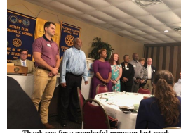
Thank you for a wonderful program last week