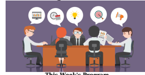
This Week's Program