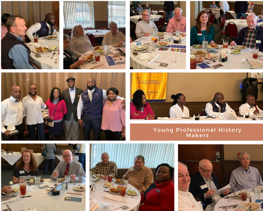
Young Professional History Makers